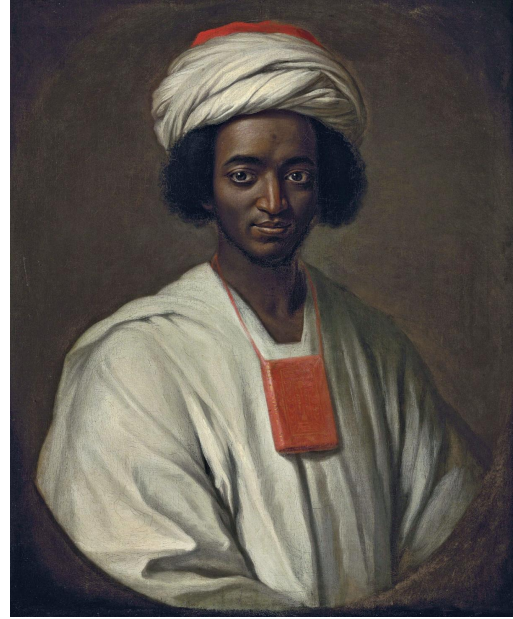
Ayubba Suleiman Diallo

illustrious history of the black Muslims of Africa who built up empires and key centers of Islamic learning like Timbuktu. In this era, black Muslim kings like Mansa Musa shone their light with both their power and their piety. Then comes a more tragic time, when during the slave trade, Islam was carried in the hearts of the slaves across the Atlantic - some of them resisted by all means from losing their deen, continuing to practice it covertly in the Americas despite the slave masters' attempts to obliterate all aspects of their past identity. There is the remarkable account of Ayubba Suleiman Diallo, for example, a noble from Senegal who was enslaved and who wrote down the whole Quran by hand three times from memory. And now, of course is the story of the contemporary black Muslims who work to shape both the black and Islamic narrative. We continue to find among them sources of inspiration such as Imam Siraj Wahhaj and Sh Abdullah Hakim Quick.