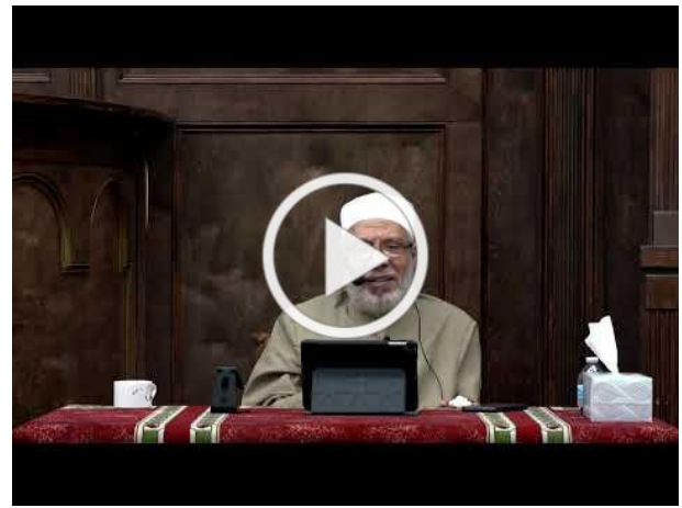
محاضرات التفسير للدكتور صلاح الصاوي - سورة النساء 100 Surah An-Nisaa 100