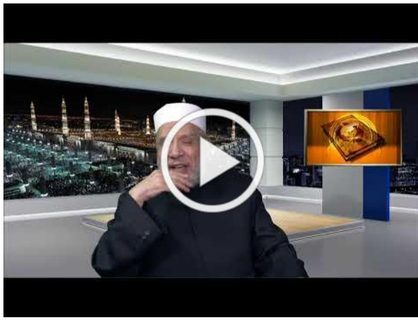
فتاوى على الهواء الدكتور صلاح الصاوي Weekly Fatawa - Feb 11, 2020