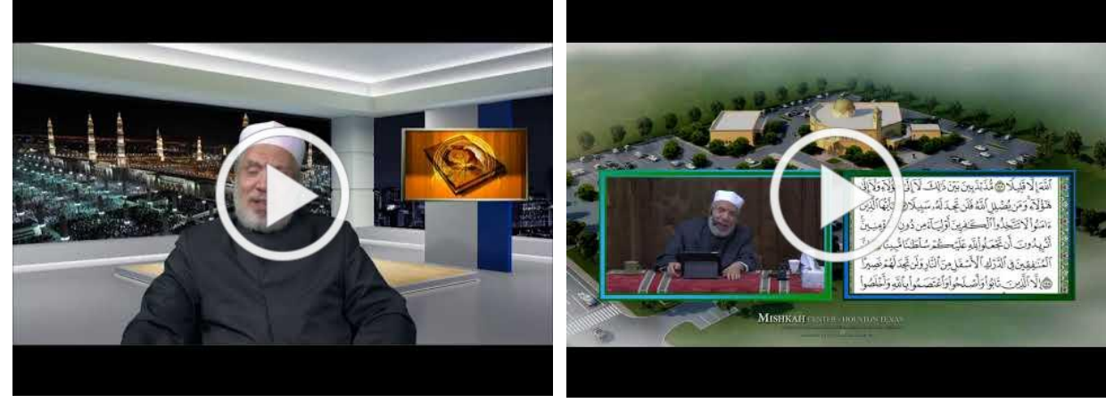
الدكتور صلاح الصاوي - بث مباشر Weekly Fatawa - Feb 25, 2020